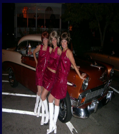
The Glamour Girls